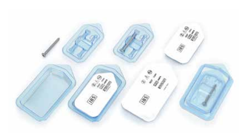
Inside IBS No. 2 for four different screws and standard outside IBS No. 3 each made of PETG, sealed with Tyvek®

The respectively smaller blister serves as ▶ the inside blister for the outer blister.